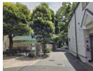
③ Turn right at the corner of the kindergarten (you will see a utility pole advertisement ahead).