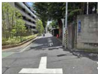
② Turn right at the T-junction.