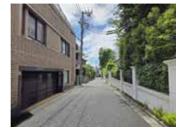
⑥ Continue straight to reach the museum.