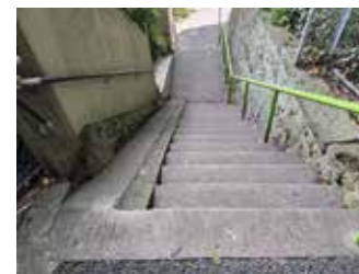
④ Go down the stairs (you will see a utility pole advertisement ahead).