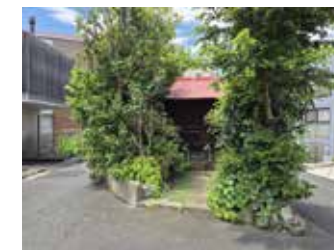
⑤ Continue straight with the Jizo-do (Jizo hall) on your right (you will see a utility pole advertisement ahead).