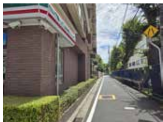
① Go through the side of the 7-Eleven.